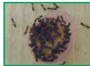
ARGENTINE ANTS FEEDING ON INVICT TM AB INSECT PASTE

Product Code: IABP535 - box of five 35 g syringes with twist on tips & one plunger