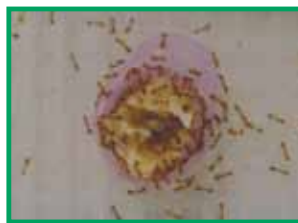
PHARAOH ANTS FEEDING ON INVICT TM AB INSECT PASTE

InVict AB Insect Paste is simply the best ant bait we've ever tested! It contains 0.05% Abamectin, which is derived from soil microbes, and a range of sweet, oil, and protein attractants (but no peanut products). Studies show that it rapidly kills workers, queens and brood, eliminating the colony quickly. It is also highly effective on cockroaches and silverfish so there's no need to carry multiple products, labels, and MSDS information around if truck space is a concern. The paste formula is simple to use and can be used indoors, outdoors and in food areas. The special formula is very slow drying and will last for three months, or until eaten.